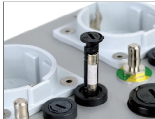
2 fuses per socket insert. Replaceable during operation.