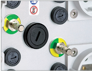
1x additional fuse against overload