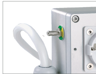
Additional potential equalization (PE) on the housing